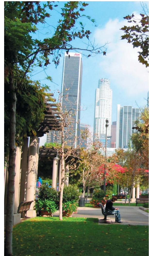
Improve Green Infrastructure and Create New Parks