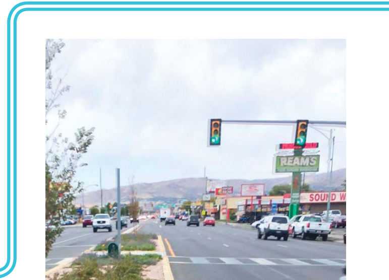
A safe midblock crossing with a pedestrian refuge at State Street and Sunset Ave.

Create a State Street that is welcoming, safe, and healthy by improving traffic safety for drivers, pedestrians, bicyclists, and transit riders , and use urban design to prevent crime and improve security .