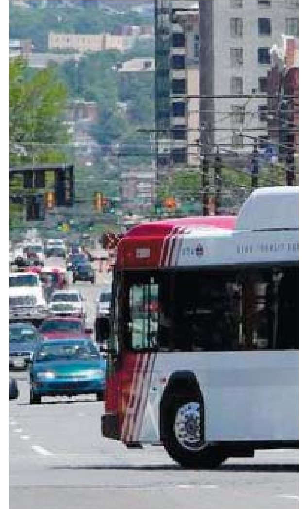
Enhancing transit and making it more attractive and accessible will improve mobility for residents and commuters