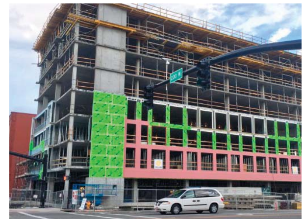
Making the right infrastructure investments and regulatory changes will help stimulate additional private investment and development along the corridor