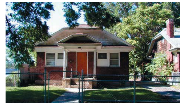
Allow and support a diverse mix of housing types