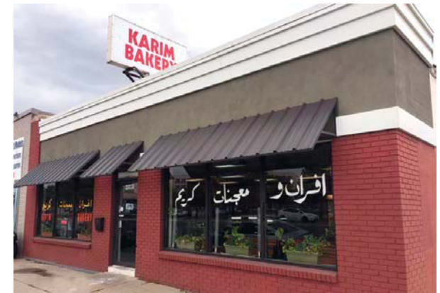
Storefront improvements on State Street will increase the liveliness of the street

Examine opportunities for infrastructure improvements , regulatory changes and public-private partnerships that increase investment and job growth , and promote a multi-faceted, internationally competitive corridor .