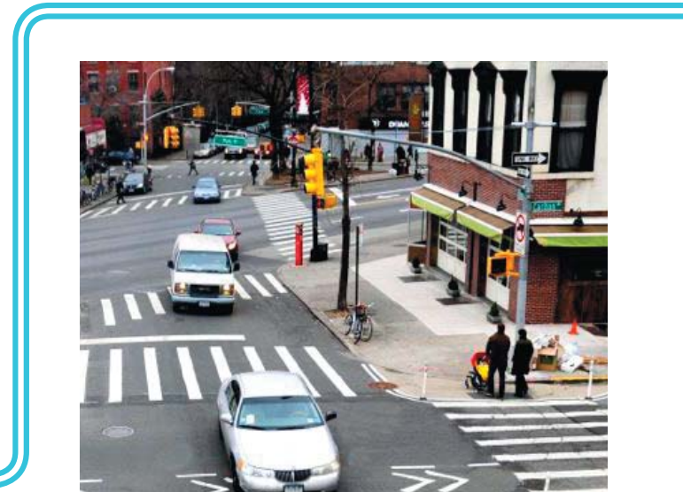
Increasing the number of high visibility crossings will better connect State Street to surrounding neighborhoods and services

Expand opportunities to safely cross State Street, connect more people to more places in and around the area, and improve access to nearby schools, businesses, and community services .